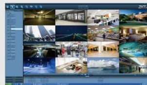
ZKVISION Software(Included in CD)